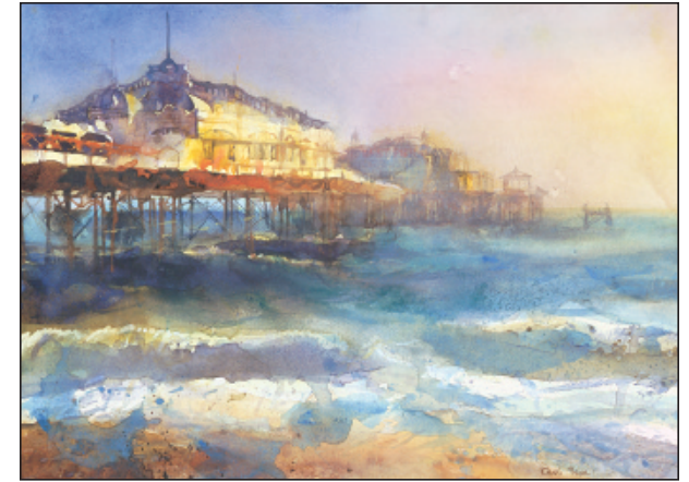
West Pier, Brighton.